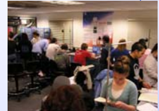
Students in the general physics laboratory - Fall 2006