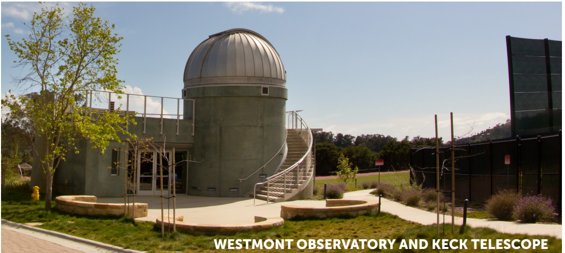
WESTMONT OBSERVATORY AND KECK TELESCOPE

Once Westmont's observatory, Carroll Hall now serves as a large classroom for general education courses. You can find Westmont's new observatory (pictured below) by the baseball field. Every third Friday of the month, the college opens the observatory to the public, and you can look through the telescope at planets, stars, moons and other celestial sites.