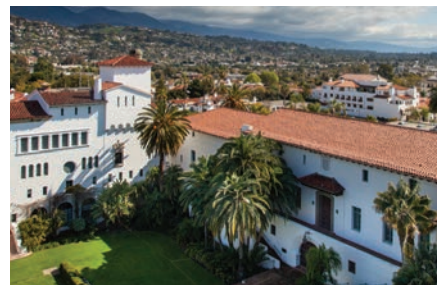
4. VIEWS AT THE COURTHOUSE