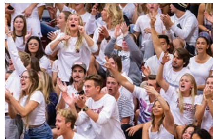
1. CHEER ON THE WARRIORS

The stunning coastal city of Santa Barbara isn't just a backdrop — it's part of your college journey. Whether you love beach volleyball, hiking, great art, good eats, or thrifting, you'll never be bored!