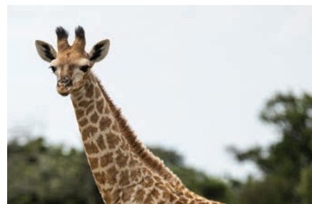
2. SANTA BARBARA ZOO