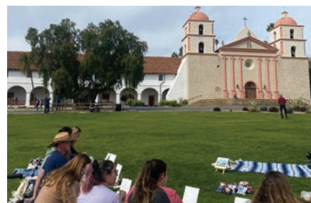
5. SANTA BARBARA MISSION