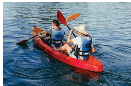
3. KAYAK OR PADDLEBOARD AT THE HARBOR