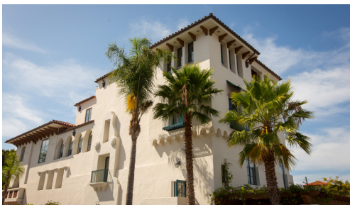
Westmont's new Accelerated Bachelor of Science in Nursing (ABSN) program launches in spring 2022 pending approval from the California Board of Registered Nursing.

Westmont celebrates its faithful donors who, in the past fiscal year, donate a record $32.7 million for new projects, student scholarships and academic programs.