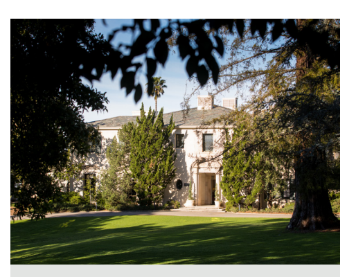
Westmont balances its budget for a record 37th straight year of operating in the black.