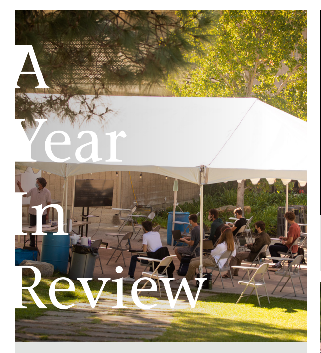
Students return to campus and study and live safely in community for the entire year.