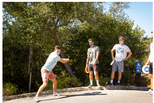
Westmont successfully manages COVID-19 on campus.