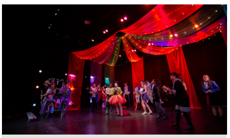
The arts at Westmont create innovative virtual concerts, exhibits and theatrical productions.