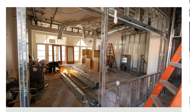
Donors contribute nearly $10 million to purchase the Westmont Downtown building.