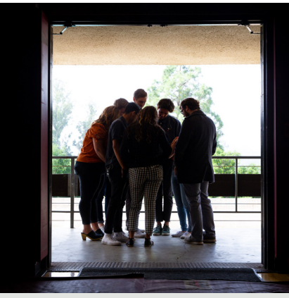
$1 million Lilly Endowment grant helps Westmont establish the Center for Thriving Communities.