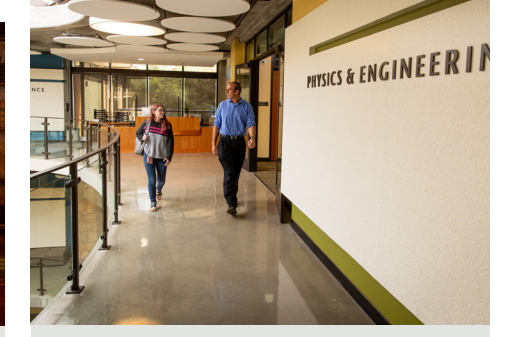
Westmont raises nearly $1.7 million to construct a new engineering building to support the growing engineering program.