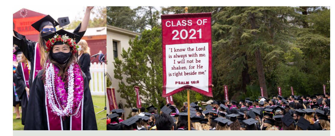
Westmont holds a Commencement ceremony in person and celebrates the class of 2021 in a socially distanced service.